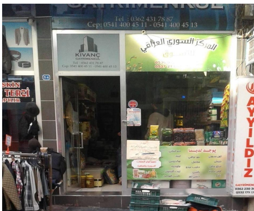
An Iraqi tradesman in Samsun Hürriyet

artisans in the city. Additionally, in an interview with the Mukhtar of Hurriyet neighborhood, he stated that there are many refugees opening bakeries making Syrian bread and they also employ Syrians. Some other refugees are working as workers in constructions. The wage reaches 40TL per day in the works that require too much effort but as the winter comes, these works are also interrupted. The ones working in artisan shops gain between 20 to 30 TL per day. The rents in the city is approximately 500-600 TL and because of that the refugees face serious problems in providing for themselves.