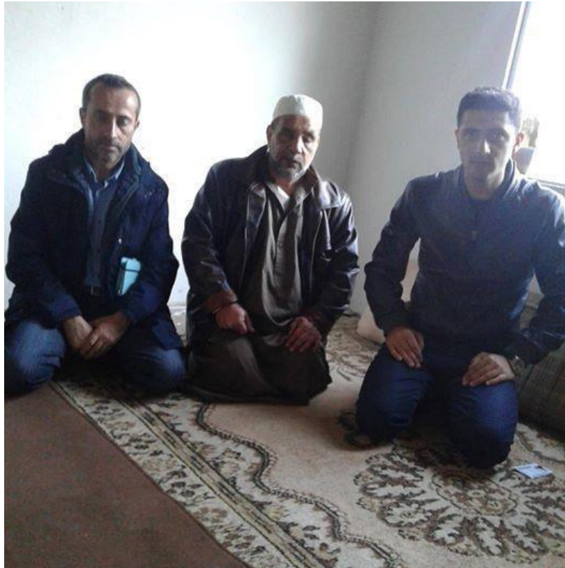
A visually impaired Syrian living in Samsun's Fatsa district

of them have disabled people. In the interviews, 8 families told that they can not find vehicles to transport them to the hospitals and they can not access to the health services.