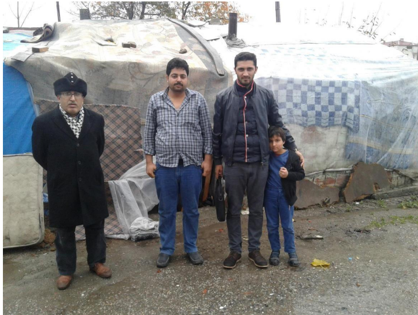
A tent in Samsun-Bafra. 16 People are living in this tent.

Most of the refugee families living in Samsun, resides in Canik County and they mostly consist of Syrians and Iraqis. The houses in this county are old houses, rents are fairly cheaper and industry is settled here. For this reason, refugees are mainly gathered in this area. The refugees living in this area mainly reside in Karşıyaka and Soğuksu neighborhoods, however, there are also many refugees living in Kuzeyyıldızı neighborhood, Gazi neighborhood and Belediye Evleri neighborhood. In the studies conducted in the province of Samsun İlkadım, it is seen that refugees generally live in Hurriyet and 19 Mayıs neighborhoods while there are approximately 40 Circassian originated Syrian families and most of them are related to each others. Most of the refugees here, live in Fenk and Elmalık neighborhood. In Bafra County there are approximately 60 families and these families are resided in the neighborhoods near the agricultural work places and İshaklı neighborhood. Lastly there have been studies conducted in Atakum County, in these studies it is seen that the district is a new settlement and for this reason the rents are higher and refugees here are in a better condition.